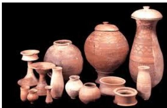
Figure -1- Ancient Terracotta's.