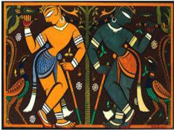
Krishna and Balarama, tempera on card, 36 x 63.5cm, 1940s